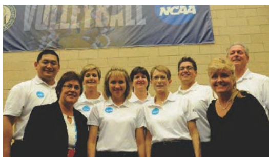
Division III Championship Crew