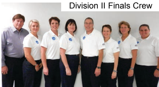
Division II Finals Crew