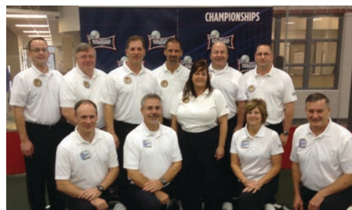
NJCAA DII Championship Crew