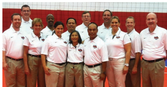
Division I Floor Crew

pledged themselves to being the last thing that the referees had to worry about. The NCAA staff and Division I Championship committee were suitably impressed; we've already been assured that PAVO will be able to provide the support crew in Seattle as well.